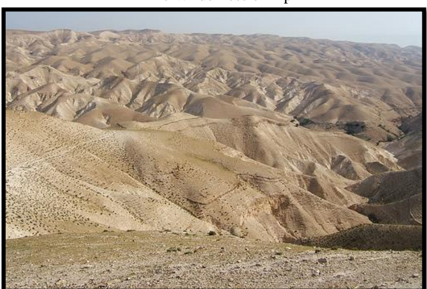
The Wilderness of Ziph

26:1 —The Ziphites disappoint David once again (cf. 23:19-20) as they betray him to Saul.