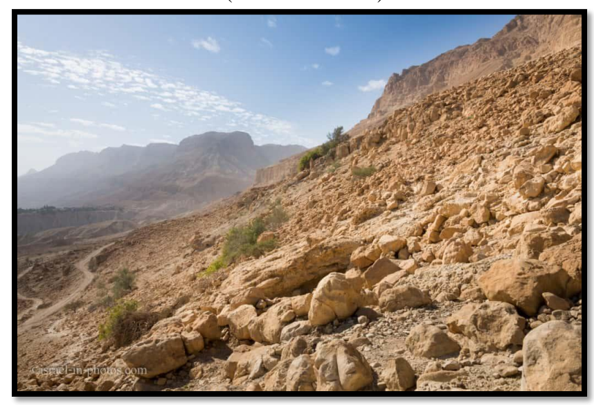
https://www.israel-in-photos.com/ein-gedi.html [En-Gedi is the largest oasis in Israel. It has a stream & waterfalls.]